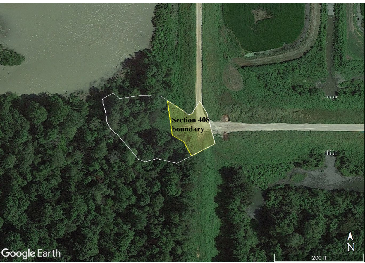
Figure 2. Section 408 boundary within proposed construction area for boat ramp and parking area at Hornersville Swamp Conservation Area, in Dunklin County, Missouri.

PROJECT DESCRIPTION: Section 408 authorizes USACE to grant permission for the alteration or occupation or use of the project if USACE determines that the activity will not be injurious to the public interest and will not impair the usefulness of the project. The Mississippi River and Tributaries system, the federally authorized civil works project proposed for alteration, provides for managing flood risks to lands outside of the levees from floodwaters of the Mississippi River. Federal responsibility extends 15 feet from the landside berm and 40 feet from the riverside toe of the levee (Figure 2). The proposed request involves establishment of a boat ramp and gravel parking lot for public use in an existing low area near the southern end of the Elk Chute Drainage District levee. The boat ramp is planned to be constructed with an articulated concrete block mat and will utilize a gently sloping area for water access; grades will tie into existing with slopes of 3H:1V. The parking area will be graveled.