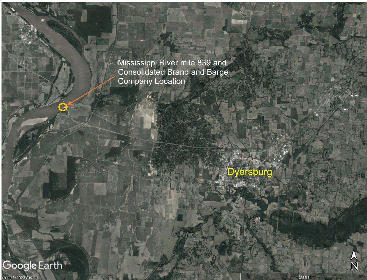
Figure 1. Location of proposed updated barge access system at River Mile 839, Dyer County, Tennessee.

INTRODUCTION: The authority to grant permission for temporary or permanent alterations of any U.S. Army Corps of Engineers (USACE) federally authorized civil works project is contained in Section 14 of the Rivers and Harbors Act of 1899 and codified in 33 USC 408. The Consolidated Grain and Barge Company (CGB) at Boothspoint near Dyersburg, Dyer County, Tennessee, has requested to repair and support the barge access system at their facility on the eastern Mississippi Riverbank, near river mile 839 (Figure 1).