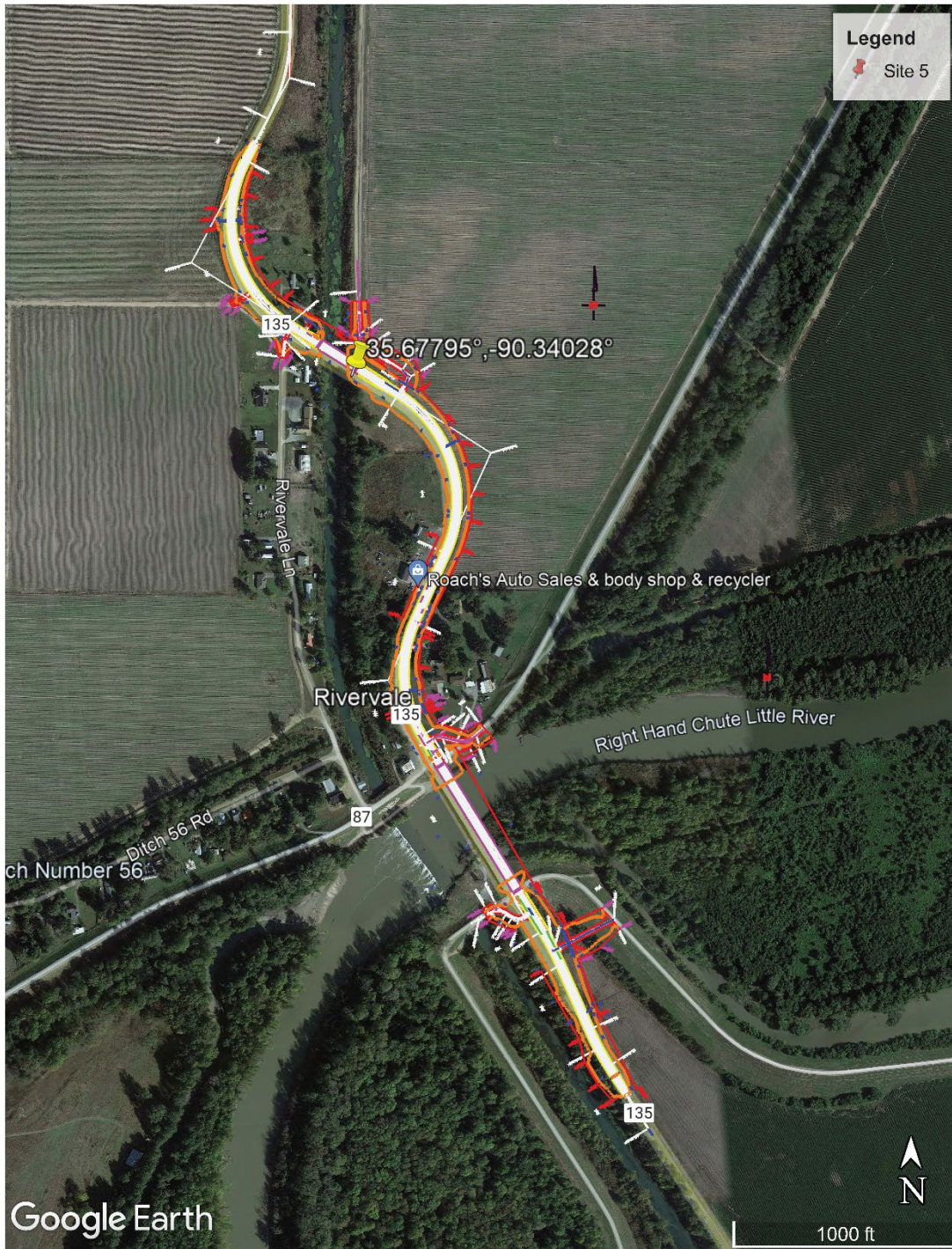
Figure 3. Proposed detail of Arkansas Department of Transportation State Highway 135 bridge replacement over Buffalo Creek Ditch, Craighead County, Arkansas.