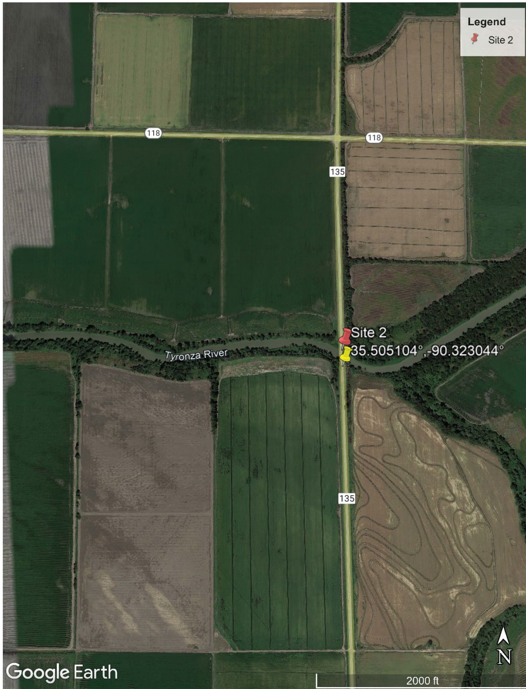
Figure 3. Proposed detail of Arkansas Department of Transportation State Highway 135 bridge replacement over the Tyronza River, Poinsett County, Arkansas.