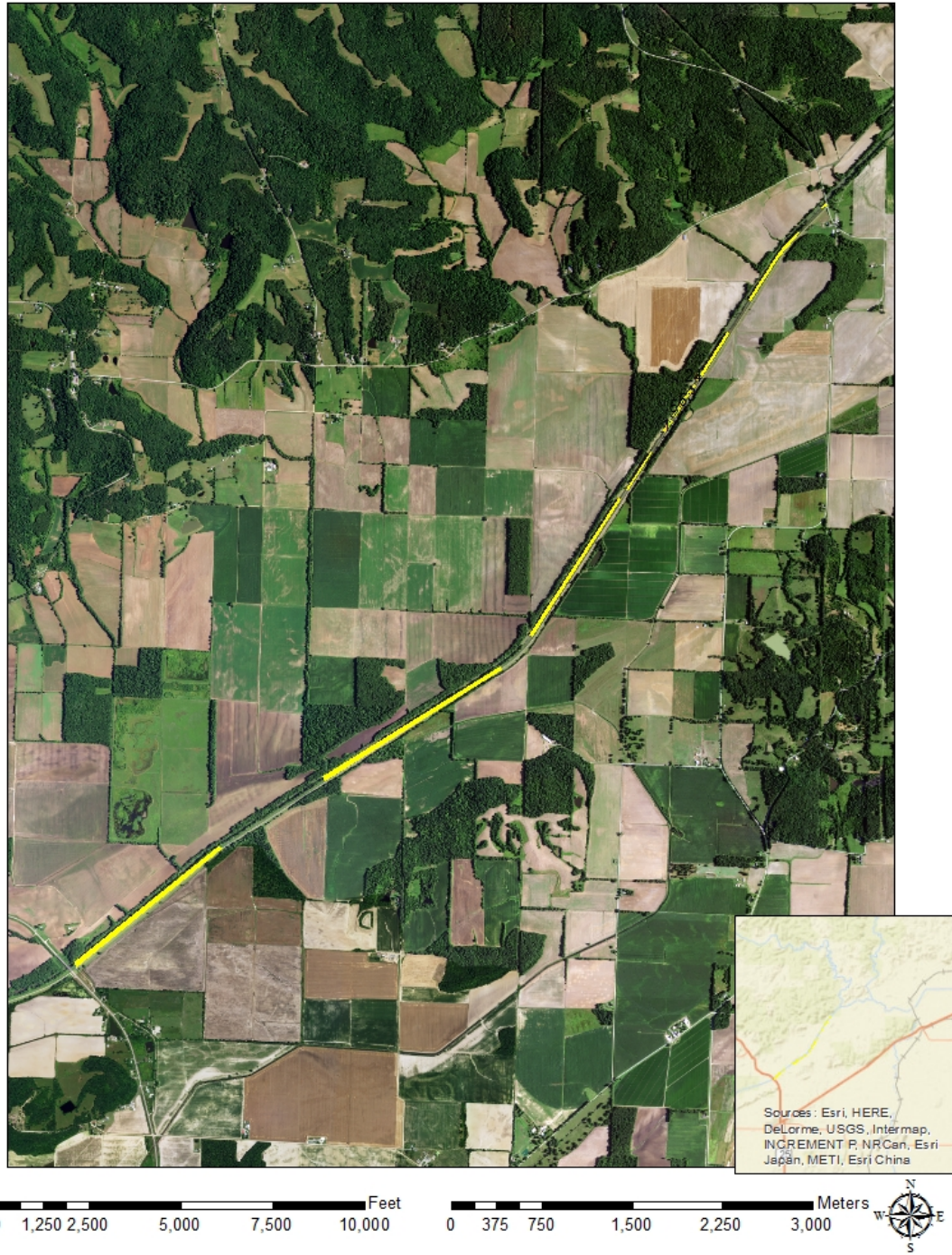
Figure 1. Location of Proposed Scour Repairs, Cape Girardeau and Bollinger Counties, MO.