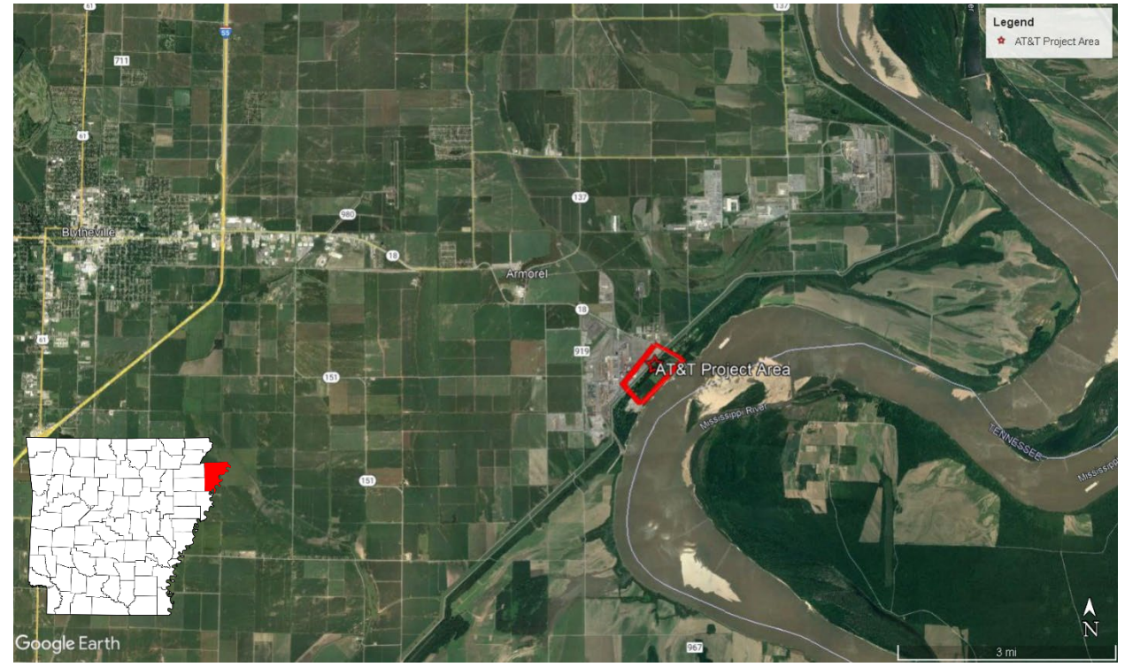
Figure 1. Locations of proposed AT&T fiber installation, Mississippi County, Arkansas.

INTRODUCTION: The authority to grant permission for temporary or permanent alterations of any U.S. Army Corps of Engineers (USACE) federally authorized civil works project is contained in Section 14 of the Rivers and Harbors Act of 1899 and codified in 33 USC 408. AT&T Arkansas is proposing to install fiber optic lines near Blytheville, Arkansas (Figure 1).