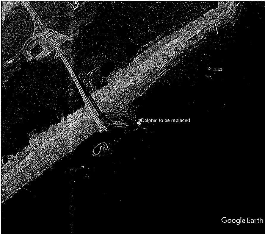
Figure 2. Location of proposed dolphin replacement, Heartland Asphalt Facility, New Madrid, Missouri.