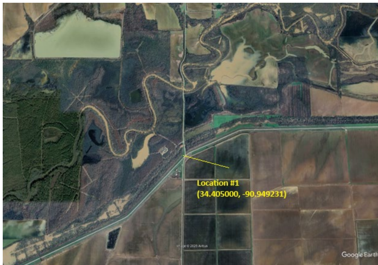
Figure 1: Project location #1 – Phillips County, AR

INTRODUCTION: The authority to grant permission for temporary or permanent alterations of any U.S. Army Corps of Engineers (USACE) federally authorized civil works project is contained in Section 14 of the Rivers and Harbors Act of 1899 and codified in 33 USC 408. Uplink, LLC is requesting to place fiber optic cable along several sections of river levee within Phillips County, AR. The federally authorized project being altered is the Mississippi and White Rivers Below Helena Levee System, which is part of the Mississippi River and Tributaries Project. The federal project at this location involves managing flood risks beginning just north of Helena, AR and extending along the west bank of the Lower Mississippi River to its confluence with the White River. Federal responsibility extends 15 feet from the toe of the riverside and landside of the levee. There are various locations proposed for this work – figures 1-3 denote approximate locations within Phillips County, AR.