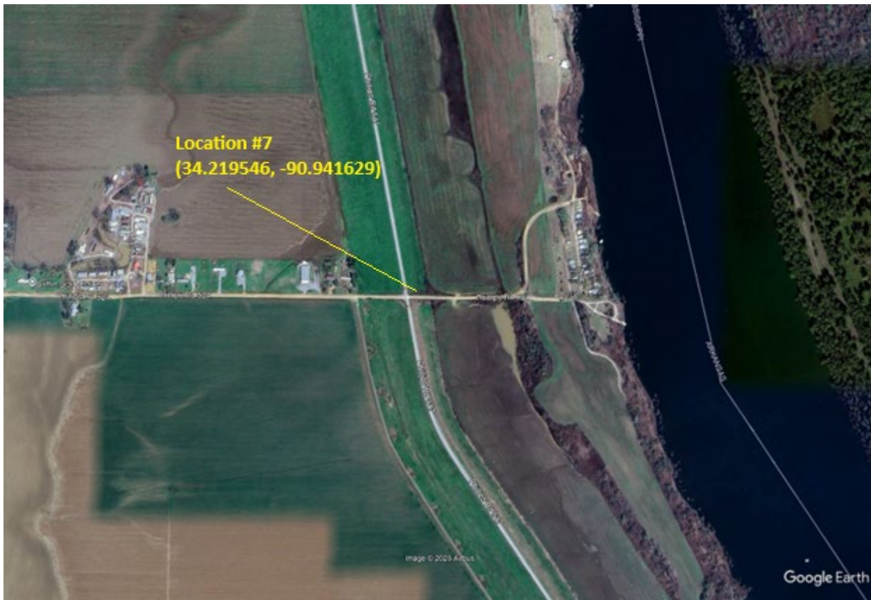
Figure 3: Project location #7 – Phillips County, AR