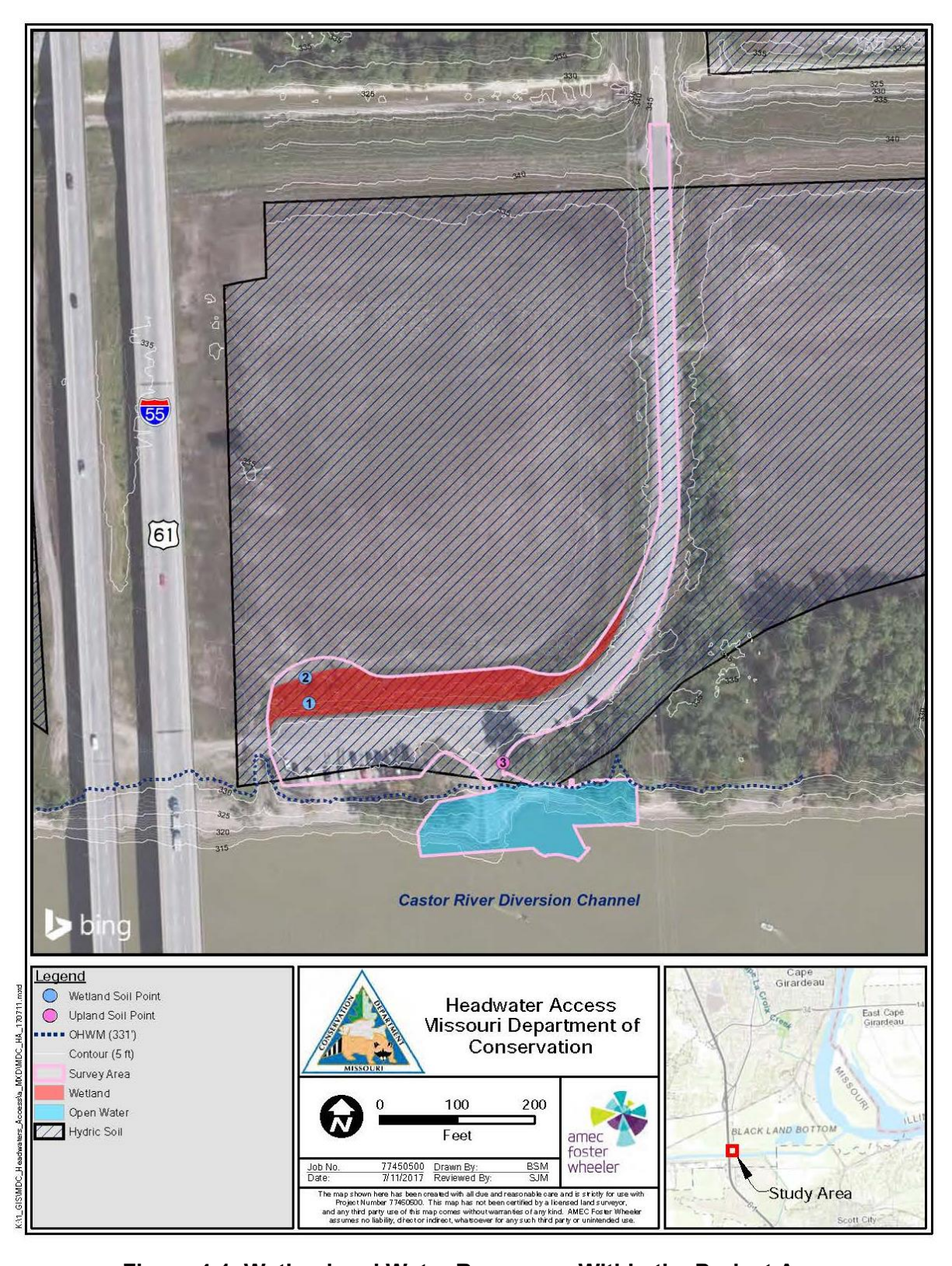
Figure 4-1. Wetland and Water Resources Within the Project Area