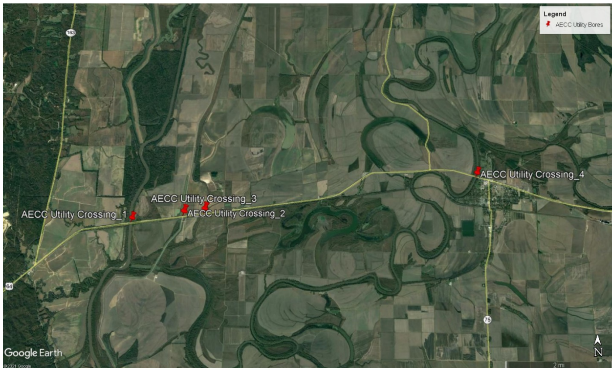
Figure 2. Locations of the 4 proposed bores sites for fiber optic cable installation.

PROJECT DESCRIPTION: Section 408 authorizes USACE to grant permission for the alteration or occupation or use of the project if USACE determines that the activity will not be injurious to the public interest and will not impair the usefulness of the project. The St. Francis Basin project, the federally authorized civil works project proposed for alteration, provides for managing flood risks to the alluvial valley in southeast Missouri and northeastern Arkansas. Federal responsibility extends 15 feet from the landside berm and 40 feet from the riverside toe of the levee. The proposed conduit routes follow the path of Highway 64. Each utility site will include two, 1.25-inch conduits that will be bored at a minimum 25-foot distance under the riverbed or levee. The four sites include the St. Francis Bayou, Highway 64 at County Rd. 401, Maggot Slough, and St. Francis River (Figure 2). The fiber optic line will be installed and maintained at no cost to the U.S. Government.