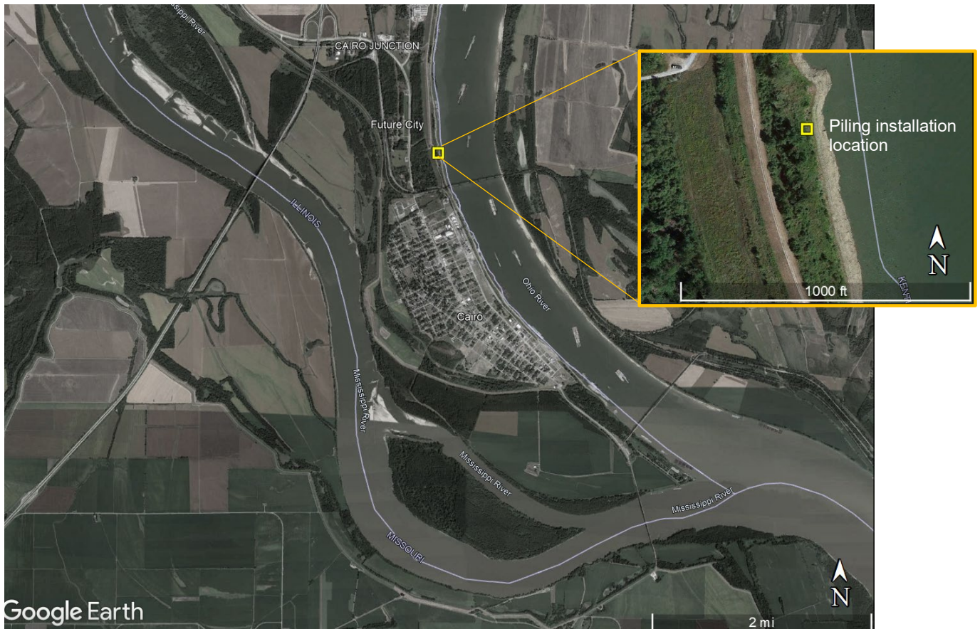
Figure 1. Location of proposed piling installation at Ohio River Mile 977, Alexander County, Illinois.

INTRODUCTION: The authority to grant permission for temporary or permanent alterations of any U.S. Army Corps of Engineers (USACE) federally authorized civil works project is contained in Section 14 of the Rivers and Harbors Act of 1899 and codified in 33 USC 408. The ARTCO Fleeting Service near Cairo, Alexander County, Illinois, has requested to install a piling on the right descending (western) bank of the Ohio River, at river mile 977, to act as an additional tie-off point for a barge fleet (Figure 1). ARTCO Fleeting Service also requests to replace their existing barge fleet with a new fleet, utilizing the same footprint permitted by USACE, Louisville Regulatory (ID #LRL-1979-00148).