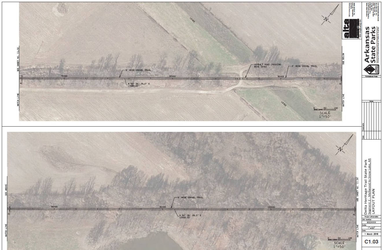
Figure 3. Profile of proposed Delta Heritage Trail improvements, Desha County, Arkansas.

ENVIRONMENTAL COMPLIANCE: A decision on a Section 408 request is a federal action, and therefore subject to the National Environmental Policy Act (NEPA) and other environmental compliance requirements. The scope of analysis for the NEPA and environmental compliance evaluations for the Section 408 review should be limited to the area of alteration and those adjacent areas that are directly or indirectly affected by the alteration. As the proposed project would not result in fill material being placed into any wetlands or waters of the U.S., a Section 404(b)(1) permit is not required from USACE Regulatory Branch. Similarly, a Water Quality Certification would not be required from the States of Arkansas. Additionally, as the proposed Section 408 alteration is within the USACE project footprint, no known historic properties would be affected. Furthermore, the proposed Section 408 alteration was determined to have no effect on threatened or endangered species or their critical habitat pursuant to the Endangered Species Act. The decision on this Section 408 request is being analyzed in accordance with NEPA and is limited to the Section 408 boundaries described herein.