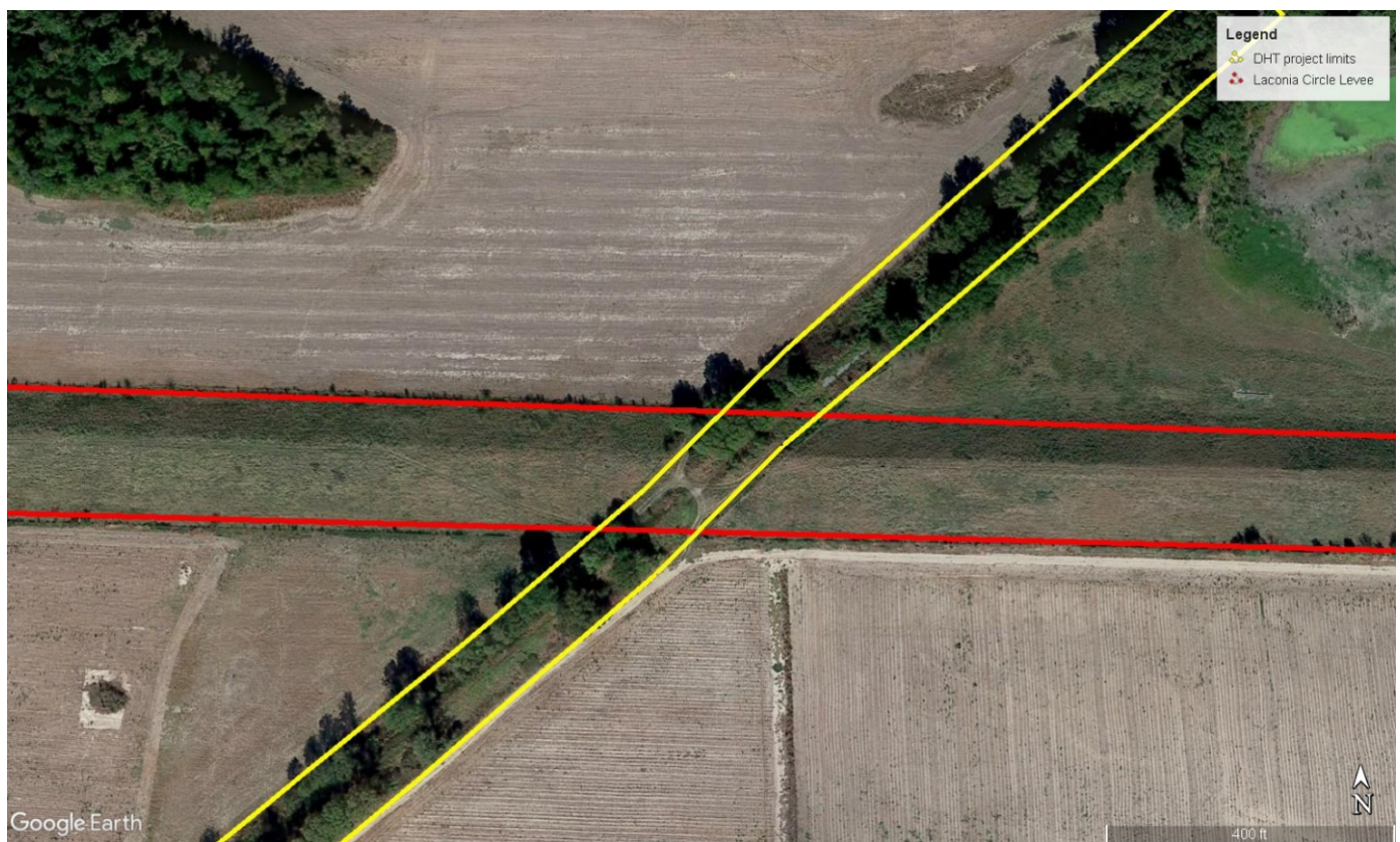
Figure 2. Location of proposed Delta Heritage Trail improvements along the Laconia Circle Levee, Desha County, Arkansas.

PROJECT DESCRIPTION: Section 408 authorizes USACE to grant permission for the alteration or occupation or use of the project if USACE determines that the activity will not be injurious to the public interest and will not impair the usefulness of the project. The Mississippi River Levee, the federally authorized civil works project proposed for alteration, provides for managing flood risks to lands outside of the levees from floodwaters of the Mississippi River. Federal responsibility extends 15 feet from the landside berm and 40 feet from the riverside toe of the levee. The proposed project will follow the existing railroad ballast alignment which crosses the Laconia Circle Levee (Figure 2). The project will include compaction and leveling of existing railroad ballast, the addition of 6 inches of new aggregate base and 4 inches of crushed stone trail surfacing. Additionally, a 12-foot long by 10-foot wide section along the Laconia Circle Levee will be paved with asphalt and gates will be installed (Figure 3).