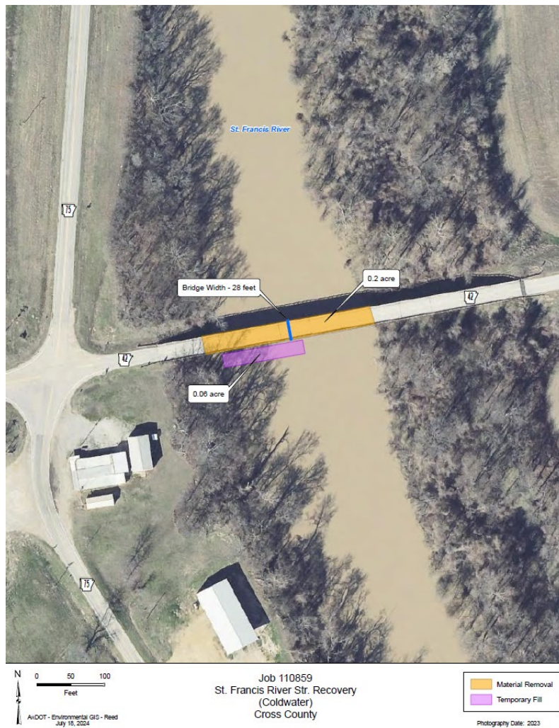
Figure 2. Collapsed bridge debris removal area, Cross County, Arkansas.

PROJECT DESCRIPTION: Section 408 authorizes USACE to grant permission for the alteration or occupation or use of the project if USACE determines that the activity will not be injurious to the public interest and will not impair the usefulness of the project. The federally authorized civil works project at this location involves maintaining the channel to manage flood risks along the St. Francis River as part of the St. Francis Basin Project and passage of these floodwaters safely into the Mississippi River. The purpose of this project is to recover the deck and pilings of the collapsed Hwy. 42 bridge from the channel of the St. Francis River at Coldwater in Cross County, AR. A large crane will be stationed on either bank and will be used to lift the collapsed deck and pilings from the river channel. Temporary fill will be placed in the river channel downstream of the bridge for a temporary work road. The area of bridge deck removal totals approximately 0.20 acres and 28 linear feet of the St. Francis River. The area of the proposed temporary work road totals approximately 0.06 acres and 20 linear feet of the St. Francis River (Figure 2). No permanent losses of Waters of the United States (WOTUS) are anticipated.