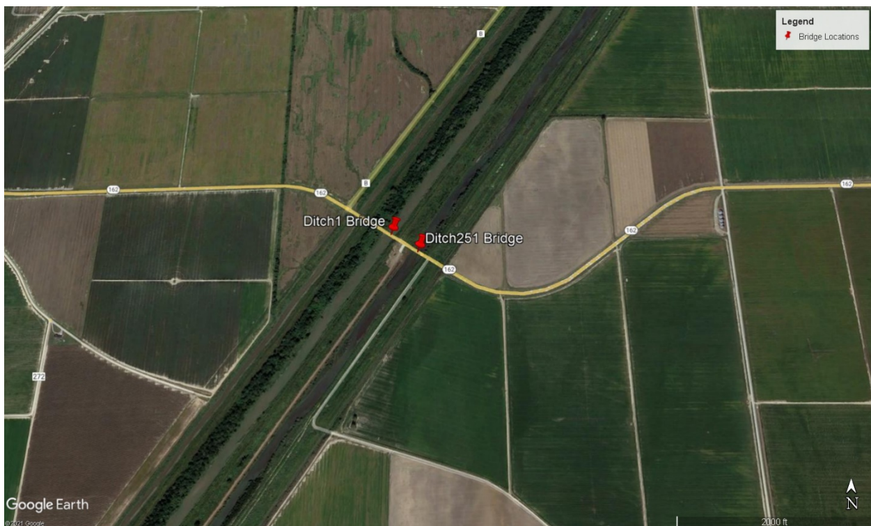
Figure 2. Proposed locations of bridges to be replaced along Highway 162, New Madrid County, Missouri.

PROJECT DESCRIPTION: Section 408 authorizes USACE to grant permission for the alteration or occupation or use of the project if USACE determines that the activity will not be injurious to the public interest and will not impair the usefulness of the project. The Mississippi River and Tributaries system, the federally authorized civil works project proposed for alteration, provides for managing flood risks to lands outside of the levees from floodwaters of the Mississippi River. Federal responsibility extends 15 feet from the landside berm and 40 feet from the riverside toe of the levee. The purpose of this project is to replace two bridges along Highway 162, crossing Ditch 1 and Ditch 251, in New Madrid County, Missouri (Figure 2). The bridges are in poor condition and in need of repair. The newer bridges will have fewer piers, which would allow better flow through the channel. Additionally, fewer piers would result in less obstructions that can catch drift, which would result in improved system operations and reduced maintenance.