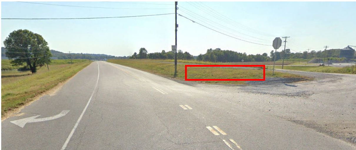
Figure 2. Proposed Welcome sign installation, Fulton County, Kentucky.

PROJECT DESCRIPTION: Section 408 authorizes USACE to grant permission for the alteration or occupation or use of the project if USACE determines that the activity will not be injurious to the public interest and will not impair the usefulness of the project. The Mississippi River Levees (MRL) feature of the Mississippi River and Tributaries (MR&T) Project, the federally authorized civil works project proposed for alteration, provides for managing flood risks to lands outside of the levees from floodwaters of the Mississippi River. The purpose of this project is to erect a “Welcome to Hickman” sign at the Hickman city limits near the Dorena-Hickman Ferry. This would consist of pouring a concrete foundation that is roughly 136 inches long, 33 inches wide, and 6 inches deep next to the Fulton County Levee. A brick sign would then be erected on top of the concrete foundation.