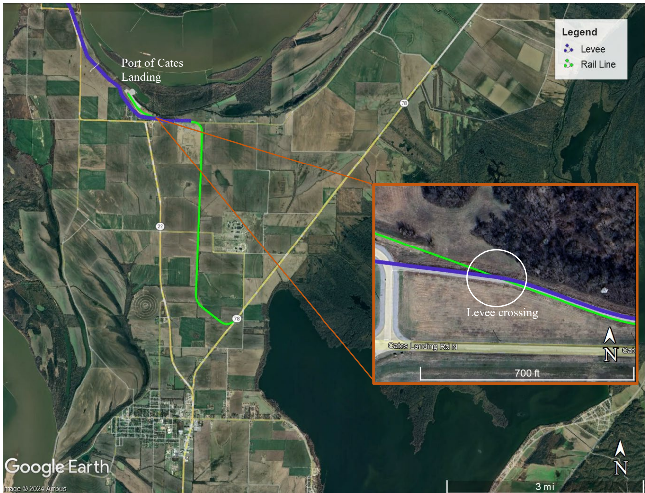
Figure 1. Location of proposed rail line extension, including levee crossing, Lake County, Tennessee.

INTRODUCTION: The authority to grant permission for temporary or permanent alterations of any U.S. Army Corps of Engineers (USACE) federally authorized civil works project is contained in Section 14 of the Rivers and Harbors Act of 1899 and codified in 33 USC 408. The Northwest Tennessee Regional Port Authority (NWTRPA) has requested a Section 408 Permission Evaluation to install a railroad line over a levee owned by the Madrid Bend Levee District of Lake County. This construction is part of a proposed 5.5-mile rail line to connect the TennKen railroad to the Port of Cates Landing (Figure 1).