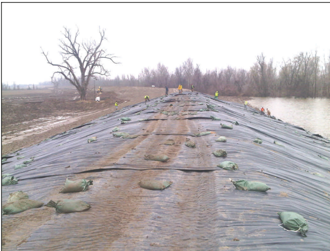
Crews cover the newly-constructed levee segment at the center crevasse with heavy plastic sheeting Dec. 6. The plastic sheeting will help protect the levee against erosion caused by wave action and rainfall. This view looks east along the levee.

The follow-on project to Operation "Make Safe", called Operation "Restore", will reconstruct the Floodway system to the pre-operational level of protection. The construction schedule is contingent on the availability of funding.