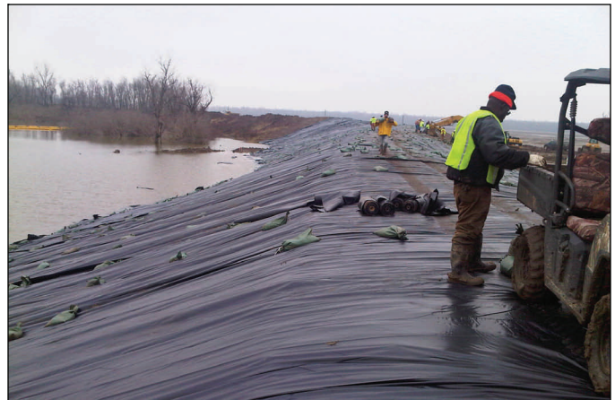
Newly-installed heavy plastic sheeting covers the levee at the center crevasse Dec. 6. This view looks west.