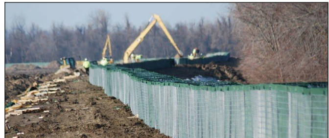
A crew fills HESCO barriers at the upper crevasse Sunday. The barriers are a temporary measure to raise the level of protection at Birds Point from 51 to 55 feet on the Cairo gage. Permanent repairs to the levee will resume after spring highwater recedes.