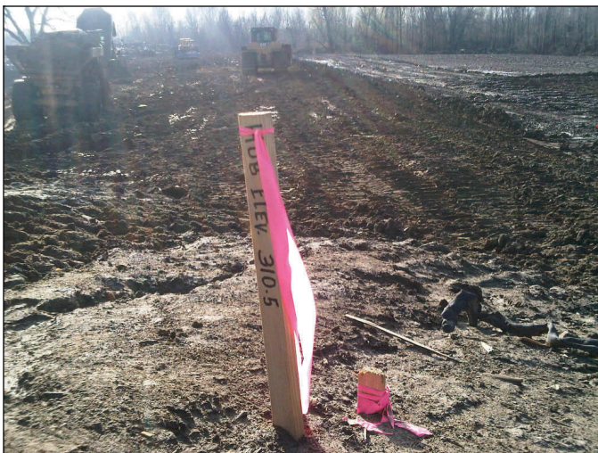
Make Safe authorizes repairs at the center crevasse to an elevation of 310.5 feet above sea level. Crews have constructed the levee to an elevation of 304 feet as of Friday morning, nine feet above ground level.