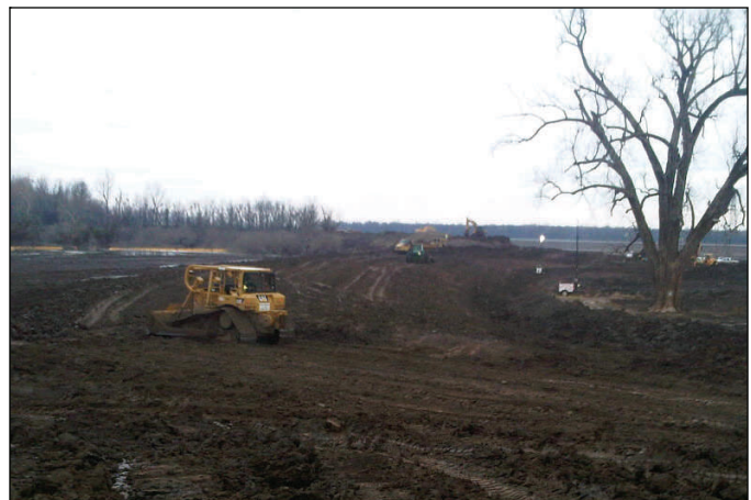
Crews reconstruct levee at the center crevasse Friday to close an 800-foot gap here.