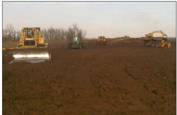
Crews reconstruct the levee at the center crevasse Friday. Earthwork resumed Thursday afternoon.

The follow-on project to Operation “Make Safe”, called Operation “Restore”, will reconstruct the Floodway system to the pre-operational level of protection. The construction schedule is contingent on the availability of funding.