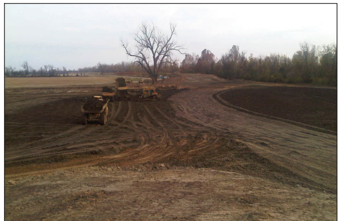
Crews deliver and spread clay Monday at the center crevasse to return the scour hole to level grade.

The follow-on project to Operation “Make Safe”, called Operation “Restore”, will reconstruct the Floodway system to the pre-operational level of protection. The construction schedule is contingent on the availability of funding.