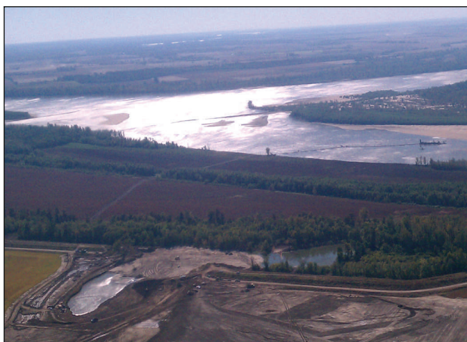
The center crevasse scour hole as seen from the air Oct. 25. The dredge Iowa is visible in the channel at top right.