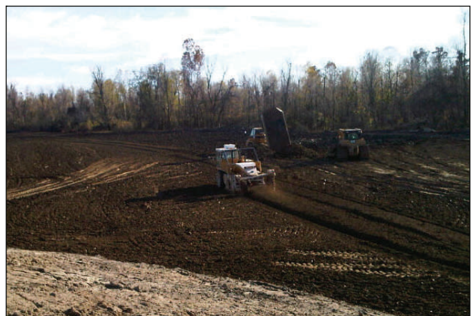
Crews deliver and spread clay Nov. 18 at the center crevasse to begin levee reconstruction.