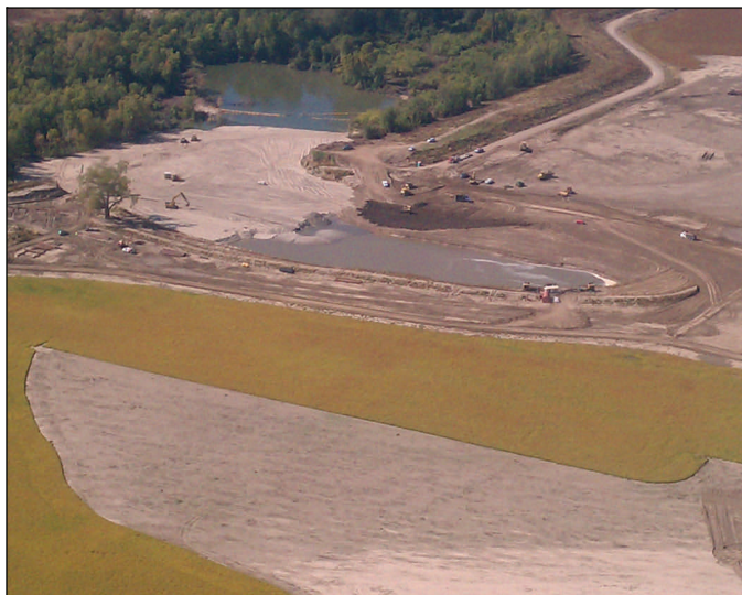
The center crevasse scour hole as seen from the air Oct. 25 during dredging. The area to the right of the levee was filled in after this photo was taken.