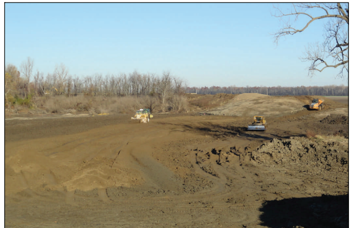
Crews deliver and spread clay Nov. 18 at the center crevasse to begin levee construction.

The follow-on project to Operation “Make Safe”, called Operation “Restore”, will reconstruct the Floodway system to the pre-operational level of protection. The construction schedule is contingent on the availability of funding.