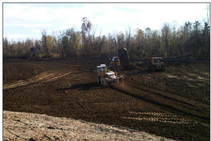
Crews deliver and spread clay Nov. 18 at the center crevasse to begin levee reconstruction.