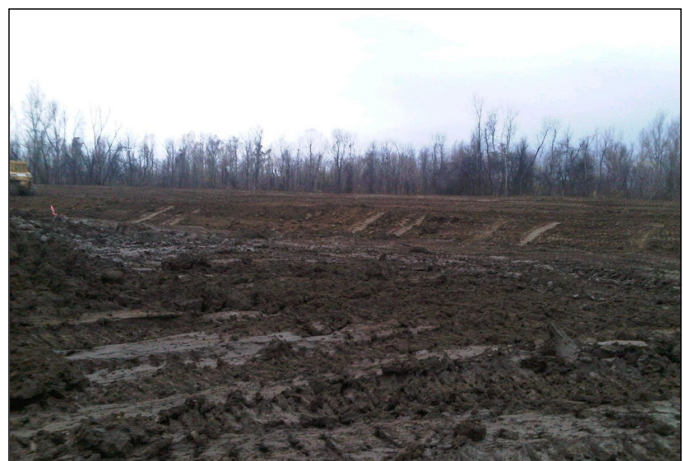
A view of the levee at the center crevasse Nov. 26. Crews have built seven feet of levee above grade.