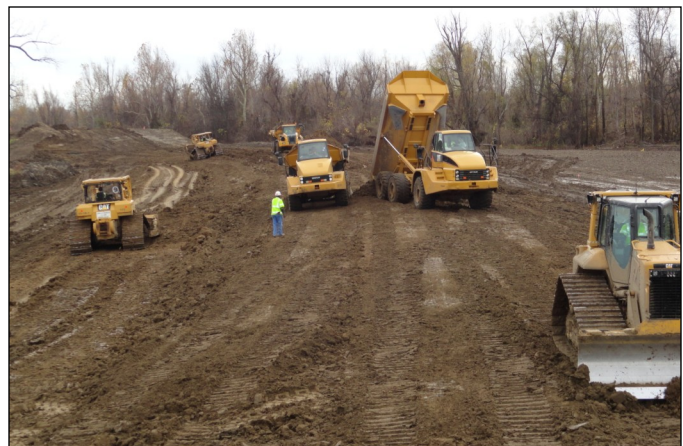
Crews construct the levee Nov. 26 to close the 800-foot gap at the center crevasse.

The follow-on project to Operation “Make Safe”, called Operation “Restore”, will reconstruct the Floodway system to the pre-operational level of protection. The construction schedule is contingent on the availability of funding.