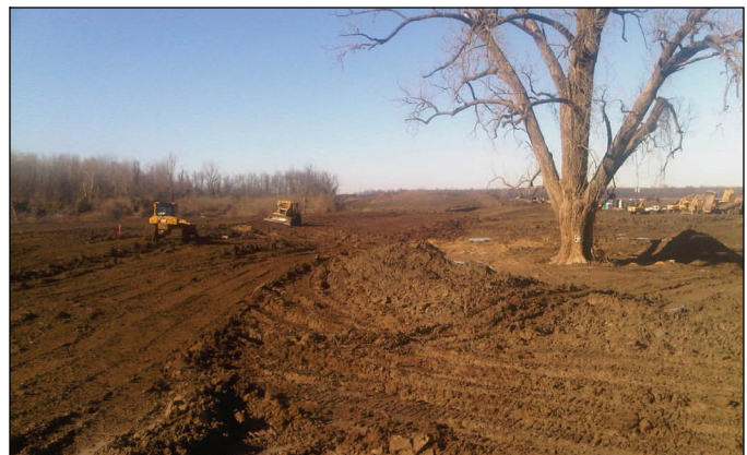
Bulldozers operators remove the top four inches of mud Nov. 30 to allow the levee at the center crevasse to dry faster. Proper moisture content is critical here.

The follow-on project to Operation "Make Safe", called Operation "Restore", will reconstruct the Floodway system to the pre-operational level of protection. The construction schedule is contingent on the availability of funding.