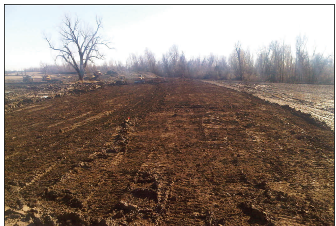
The levee at the center crevasse dries Nov. 30. Once dry, additional clay can be placed and compacted.