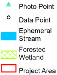
Figure 3. Delineation Map

DeSoto County, MS USGS 7.5' Quadrangle: Horn Lake, MS, 34090-H1 1S 8W Section30 NAD 1983 UTM Zone 15N 90.0846°W 34.968°N