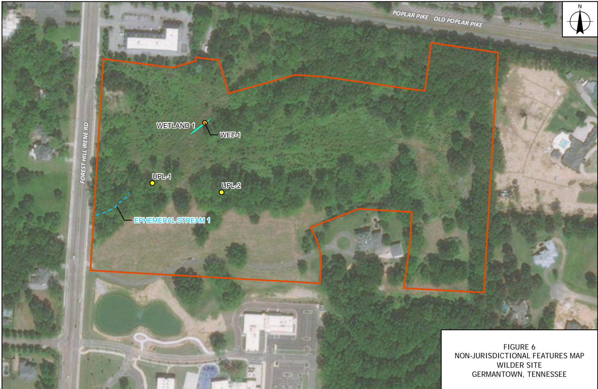
FIGURE 6 NON-JURISDICTIONAL FEATURES MAP WILDER SITE GERMANTOWN, TENNESSEE