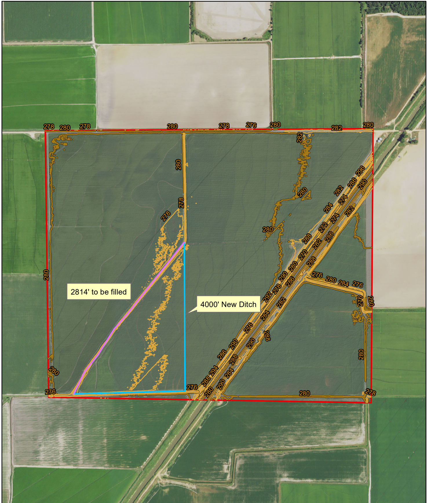
Farm 6112 Tract 23600