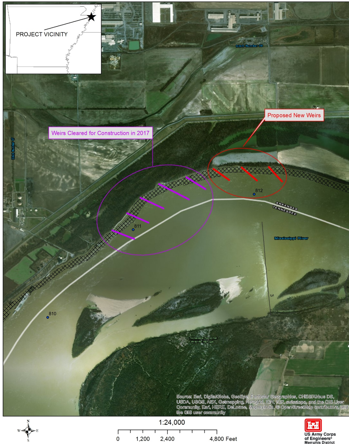
Figure 1. Project map of the three additional bendway weirs (Phase 2) located along the right descending bank of the Mississippi River near River Mile 812 above head of passes (AHP) in Mississippi County, Arkansas.