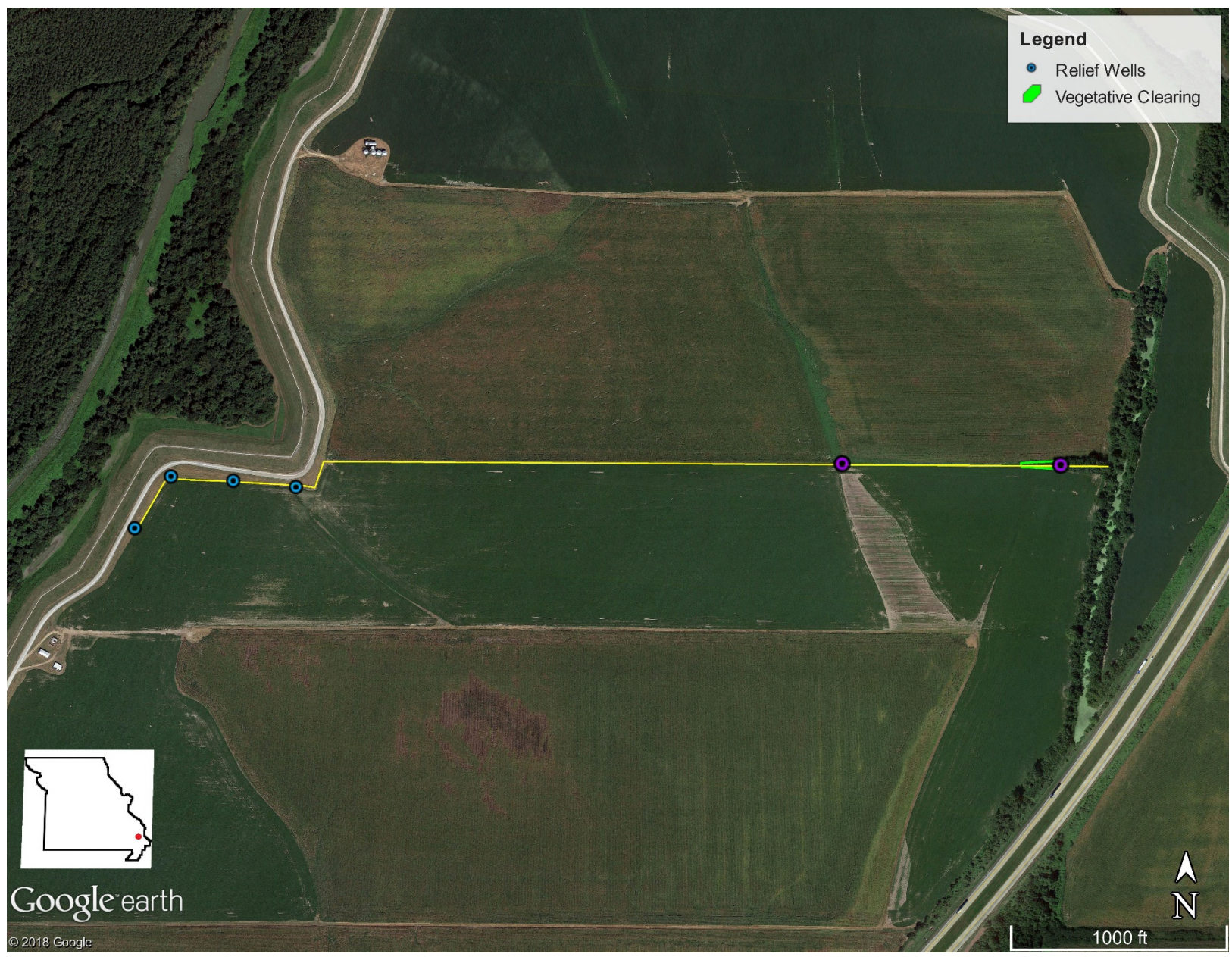
Figure 4. Proposed seepage control measures along the Mississippi River mainline levee at the Below Charleston Mile 24 project area, Mississippi County, Missouri.