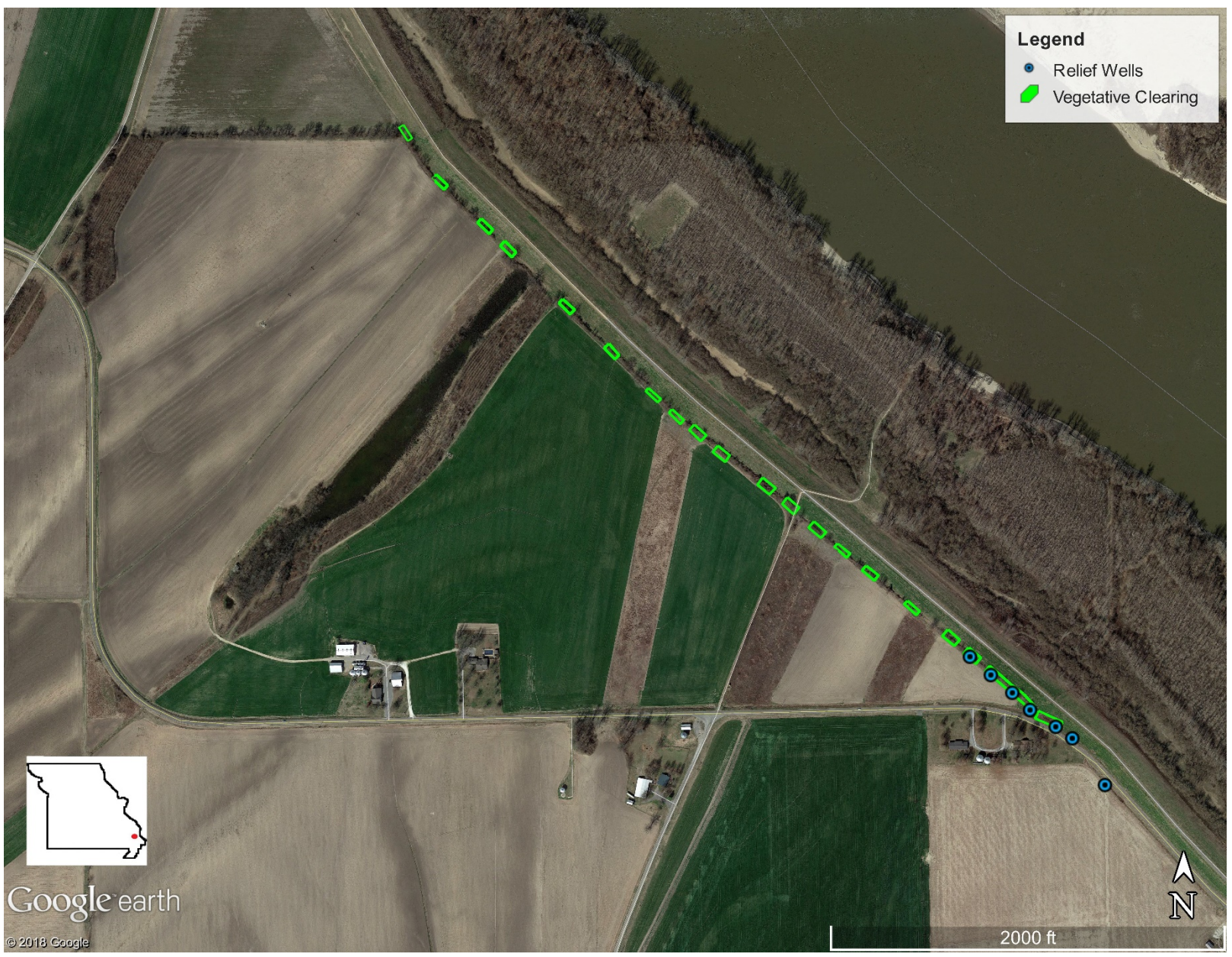
Figure 3. Proposed seepage control measures along the Mississippi River mainline levee at the Below Commerce Mile 15 project area, Scott County, Missouri.